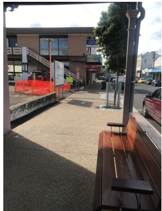
Completed CBD Revitalisation Works—Bazaar Street (Ellena—Kent Sts)